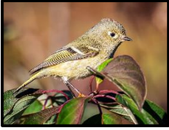
Ruby-crowned Kinglet $2 Red-breasted Nuthatch $2 Common Yellowthroat $2

Spot every species you can. When you find one, check the box and write the place and date in the blank area. Get sponsors to support your efforts to raise money for the Community Kitchen.