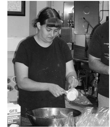
Volunteer helps bag up cereal for the Summer Breakfast Program for kids.