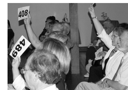
Fantastic packages were sold during the live auction.