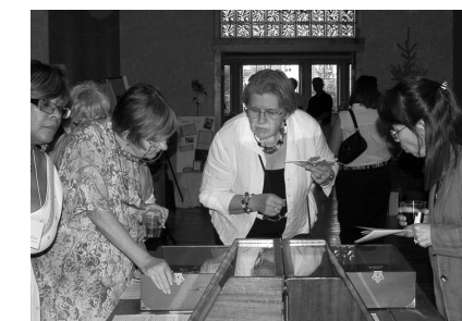
Bidders watch over the jewelry cases as the silent auction bidding closes.

Over the summer we will be working to survey community members regarding what they know about Community Kitchen and its programs, as well as, what they would like to see us be able to do in the future. Please take a minute to take this short online survey and let us know what you know at: http://www.surveymonkey.com/s.aspx?sm=2GFIhW1e6YYU5_2fXn6YpHOA_3d_3d or visit our website: www.monroecommunitykitchen.com and click on the survey link.