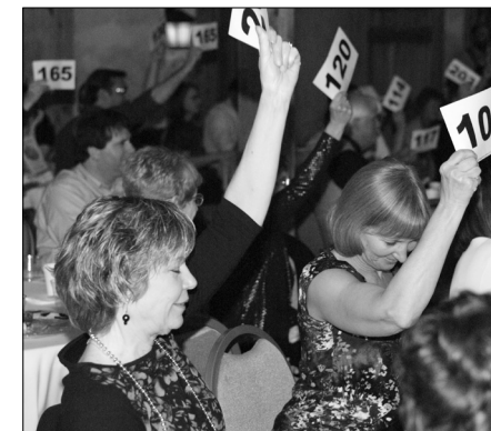
Bidding Frenzy is a popular part of the live auction, as the first hand up wins the right to purchase coveted gift certificates.