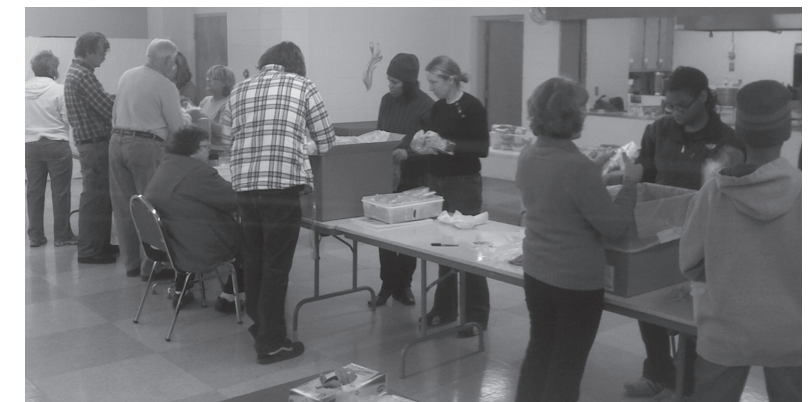
McDoel Gardens Neighborhood participates in a MLK Day project for Community Kitchen.

Community Kitchen is again grateful for the help and support of the McDoel Gardens Neighborhood on Martin Luther King, Jr. Day. Community Kitchen is nestled in the McDoel neighborhood and was the recipient of their volunteer support on January 17th for MLK Day. Neighborhood folks of all ages gathered at McDoel Baptist Church and helped portion bulk food items for our Backpack Buddies and Feed Our Future Program. Thank you, McDoel Gardens!