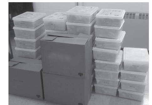
Look at all of the the containers of portioned snacks that the McDoel Gardens Neighborhood volunteers bagged on MLK Day. What a crew!

The 9th Annual Bloomington Homeward Bound Walk is a community event that benefits local, non-profit agencies, which serve those suffering from homelessness in Monroe County. All funds raised through the walk stay local. Community Kitchen is one of the agencies participating in this year's Homeward Bound walk to fight the effects of poverty and homelessness. At Community Kitchen we provide meals to anyone in need, no questions asked. As you might imagine, persons experiencing homelessness are among our patrons. In order to raise awareness and funds to continue feeding those in need, Community Kitchen will again participate in Homeward Bound. Consider supporting Community Kitchen. Simply visit: http://bloomington.in.gov/documents/viewDocument.php?document_id=2997 to join the Community Kitchen team, volunteer, donate or start your own team. "Walk a day, change a life"