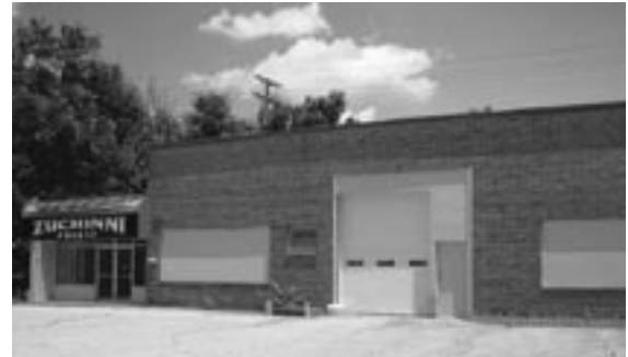
The Community Kitchen's future home. With your help we can Build the Kitchen—Feed the Community.