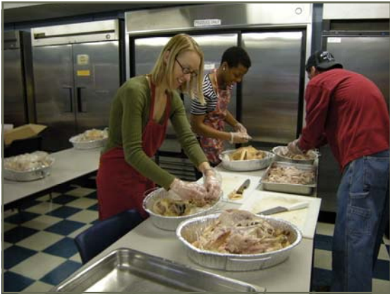
Hunger doesn't take a holiday. Neither do our volunteers.