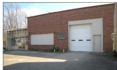
Our future home at 1515 S Rogers St.