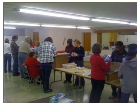
McDoel Neighborhood residents volunteer for the Kitchen on MLK Day.