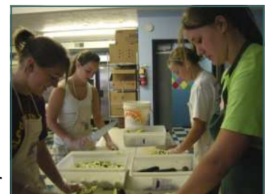
Volunteers from Girls Inc work on the salad prep.