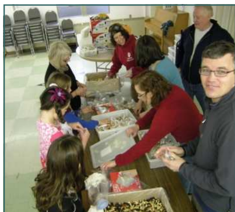
McDoel Gardens Neighborhood packages snacks for the Feed Our Future program.