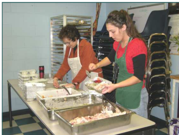
Volunteers dish up Thanksgiving carryout meals.