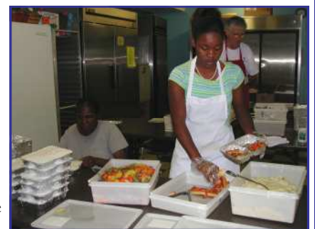
A volunteer works to dish up carryout meals that will be handed out during serving time.